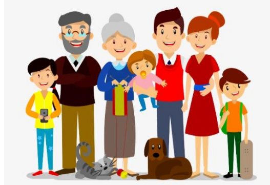
Families and Carers